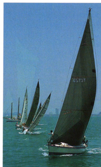
Treasure Trove (left), Foreign Exchange II at the pin end (above) and Platu start (bottom)

Coronation Cup, held annually since 1996 to commemorate the anniversary of the coronation of His Majesty King Bhumibol Adulyadej. This added an interesting class racing dimension and demonstrated that, with boats to charter, teams from abroad will participate. In this instance, five boats were chartered to crews from Singapore and the Singapore Management University.