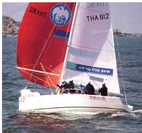
Suyasinto's Platu (above) and Optimist start (right)

With the regatta on schedule, the participants were free to do their own thing, which for some locals, meant a return