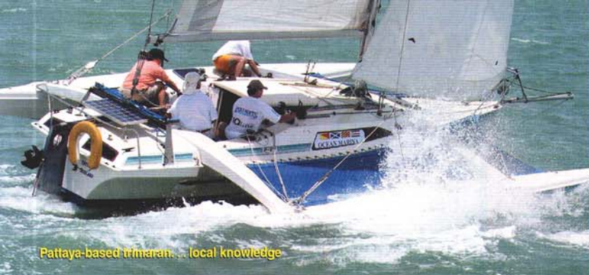
Pattaya-based trimaran... local knowledge

Continued from page 22 — appeared to take their toll, which finished 2nd. Breakaway took overall with a one minute 14 seconds margin in Race 7.