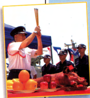
JOSS HOUSE BAY CEREMONY

P180 • Rp70000 • Bt120 • S$7 • M$12 • HK$30